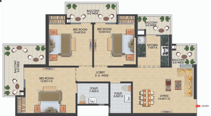
1290 SQ.FT. 3 BED ROOM + 2 TOILET (CORNER)