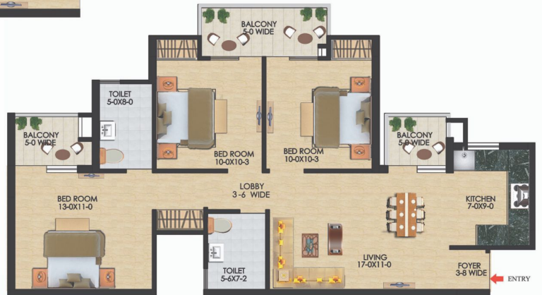
1295 SQ.FT. 3 BED ROOM + 2 TOILET