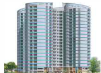
Apex Acacia Valley