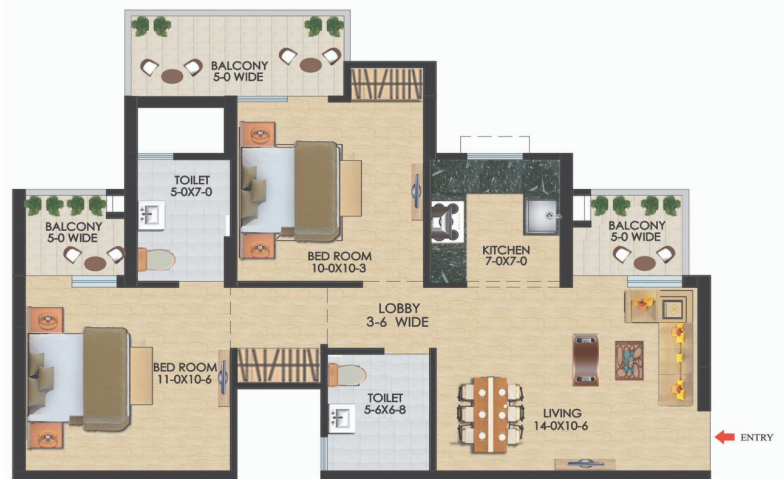
972 SQ.FT. 2 BED ROOM + 2 TOILET