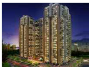
Apex The Florus