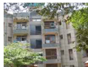
Media Times Apartments