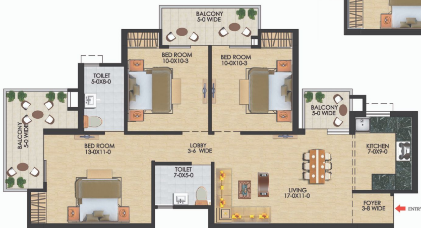
1340 SQ.FT. 3 BED ROOM + 2 TOILET