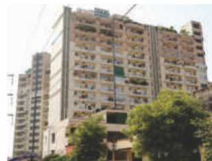
Apex Green Valley