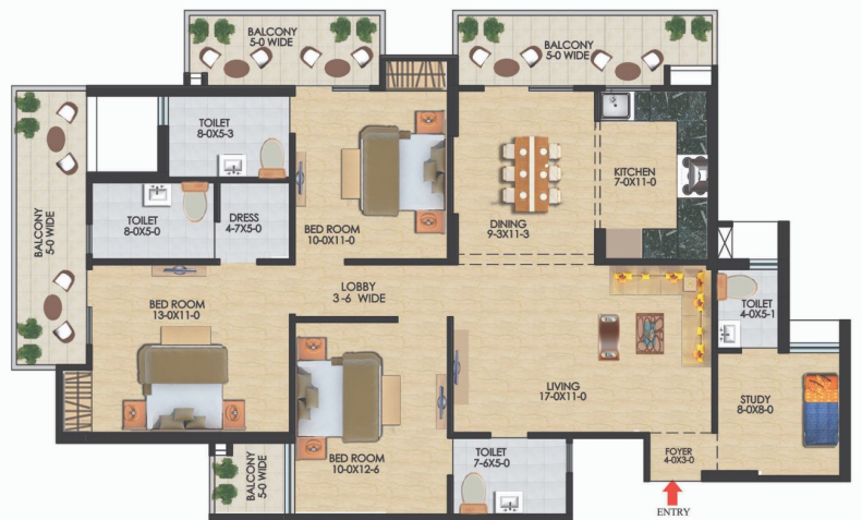
1880 SQ.FT. 3 BED ROOM + 3 TOILET + DRESS + SER. ROOM + W.C. + DINNING + ENTRANCE FOYER