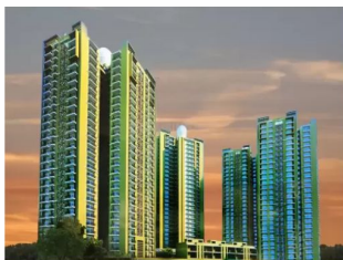
Apex Golf Avenue