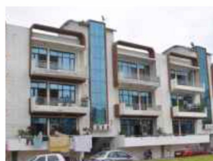
Apex Royal Castle