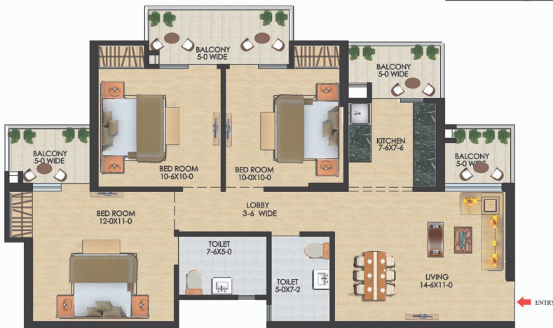
1240 SQ.FT. 3 BED ROOM + 2 TOILET