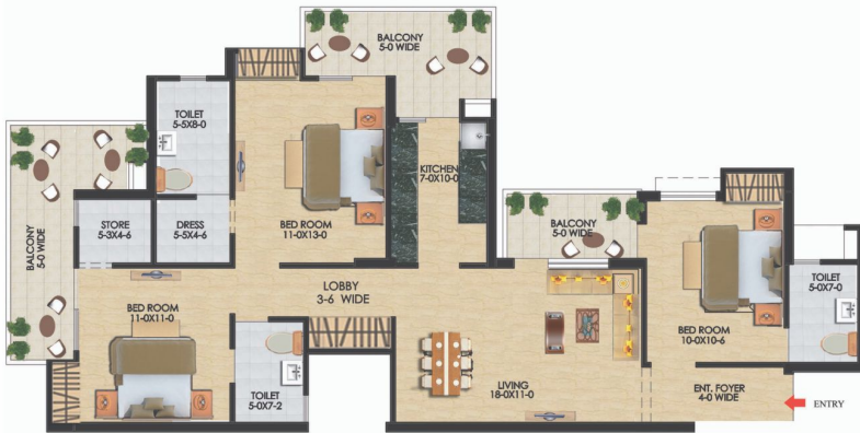
1685 SQ.FT. 3 BED ROOM + 3 TOILET + DRESS + STORE + ENTRANCE FOYER