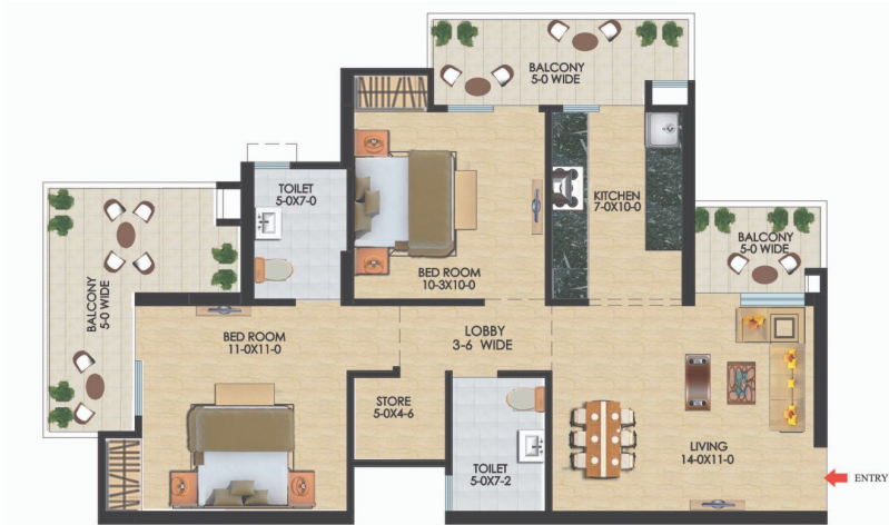
1140 SQ.FT. 2 BED ROOM + 2 TOILET + STORE